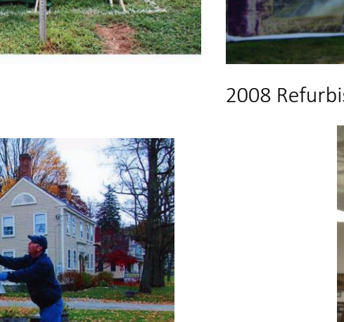
2009 Installed 3 more historic markers