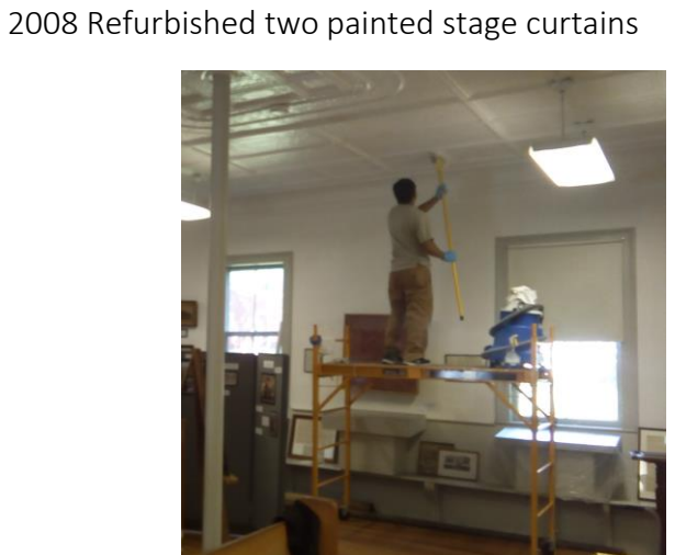
Clean-up after the 2016 Blowback