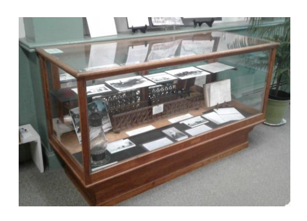
Rotating display at the Town Hall