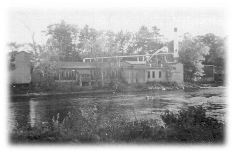
The Henniker Handle shop c.1930