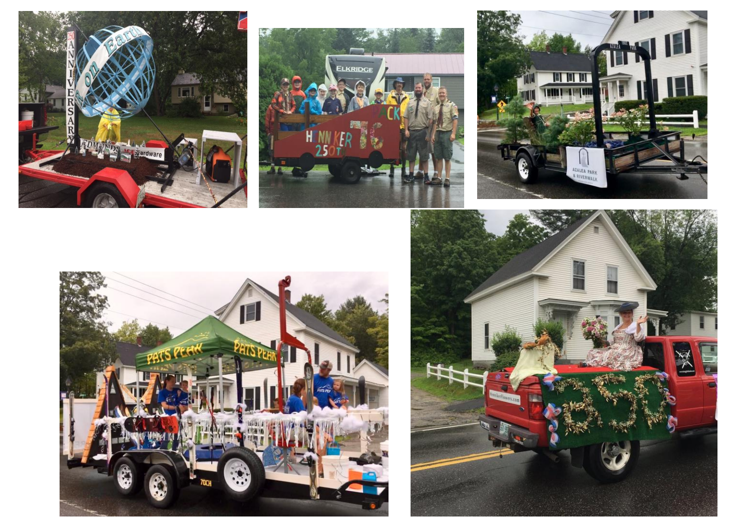
Float Winners: Most Henniker Spirit Edmunds Hardware; Most Community Spirit: Boy Scout Troop 76; Most Artistic: Azalea Park; Most Elaborate: Pat's Peak; Most Patriotic: Hollyhock Florist

Again, rain Saturday morning put the big parade in doubt, but Mother Nature took pity upon us and the weather cleared long enough for the parade to take place. The crowd was light, but enthusiastic.