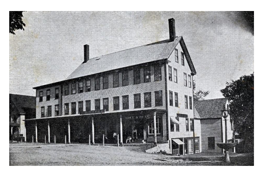
Pre-1896 Noyes Block.