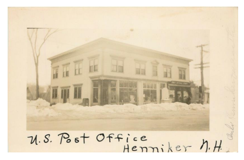
The Noyes Building rebuilt in 1914, notice corner entrance door on left.